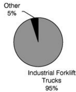
Fiscal 2004 Motive Power Sales

Our motive power products include complete systems and individual components used to power, monitor, charge and test the batteries used in electric industrial forklift trucks and other material handling equipment. Motive power batteries typically are designed to provide relatively high discharge rates for a six- to eight-hour operating period. They also require rugged design to withstand the rigors of operation within moving industrial vehicles that subject them to high levels of vibration and shock.